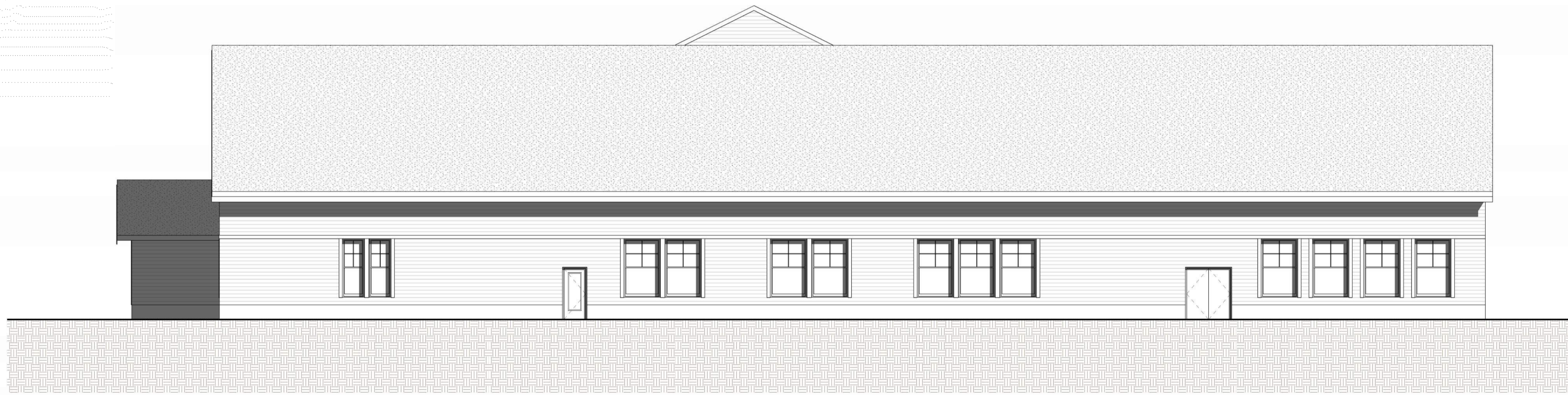
2 EXTERIOR ELEVATION SCALE: 1/8" = 1'-0"